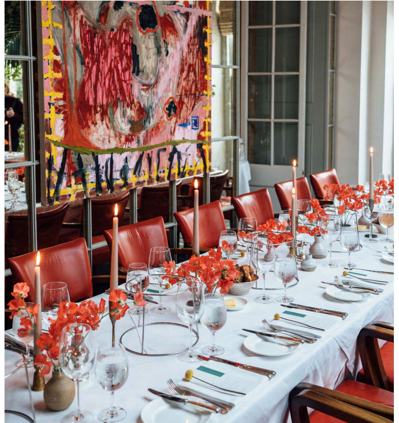
The Shannon's Photography