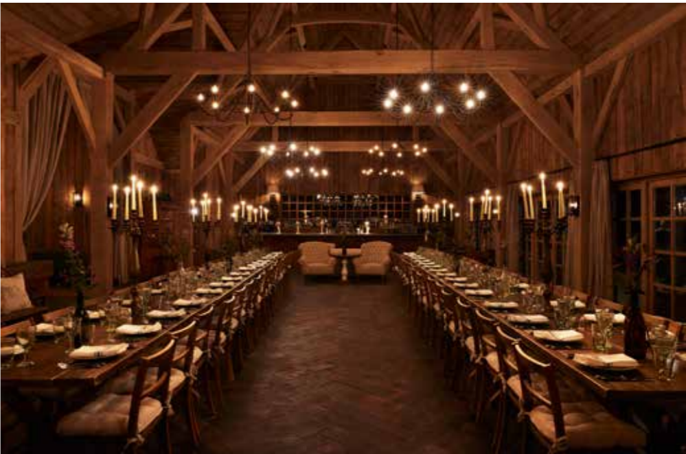
Clockwise from far left: Hay Barn, Boathouse exterior, Deli, Barwell Barn