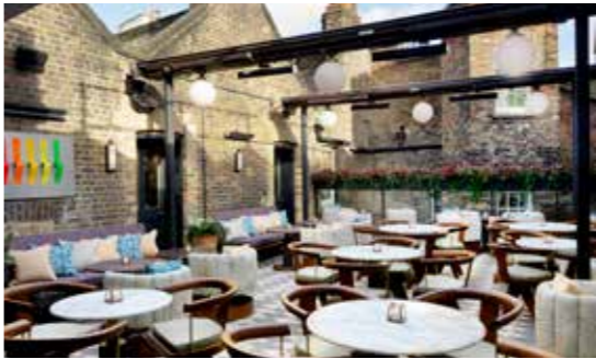
Clockwise from far left: The Circle Bar , Yellow Dining Room , Courtyard , Red Dining Room