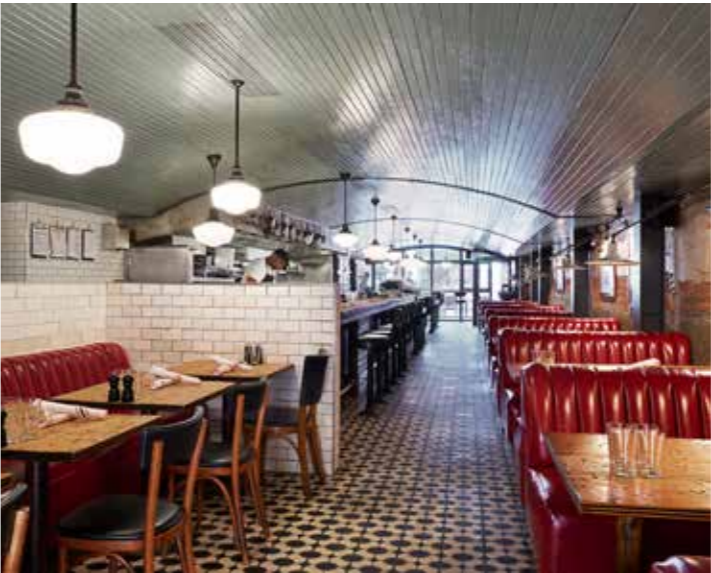
Clockwise from far left: The Allis White City ; Cecconi's Pizza Bar ; Electric Diner ; Cafe Boheme