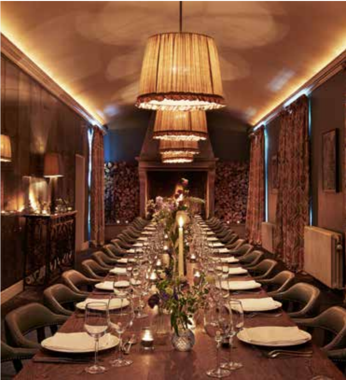
Clockwise from far left: exterior of the House, bedroom, Log Room, Orangery