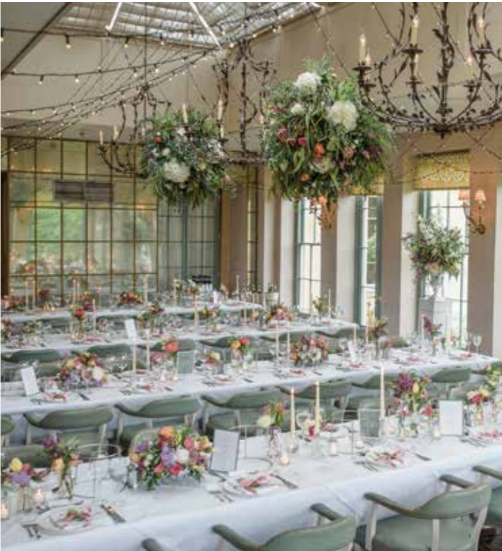
Clockwise from far left: the Chapel and exterior of the House, the Orangery, bedroom