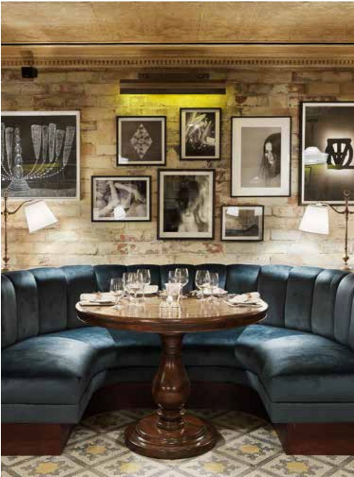
Clockwise from far left: the exterior of the House, club space