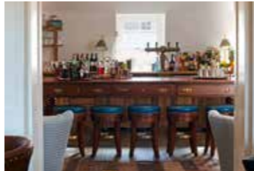
Left to right: the restaurant; the top floor and library bar; the small sitting room; screening room