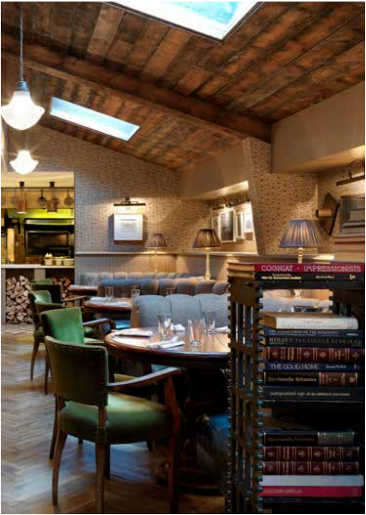
Clockwise from far left: the Library , Club space , Snug