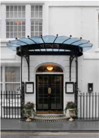
Clockwise from far left: the Champagne Bar, exterior of the Townhouse