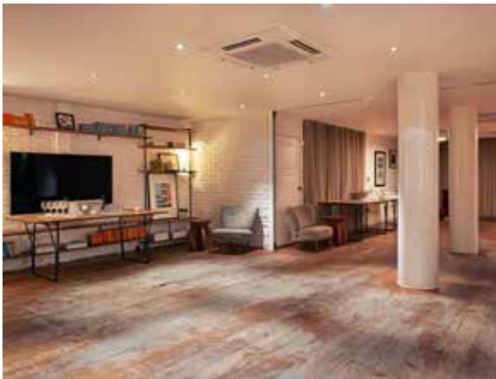
Clockwise from far left: Hoxton Grill Apartment and Conservatory