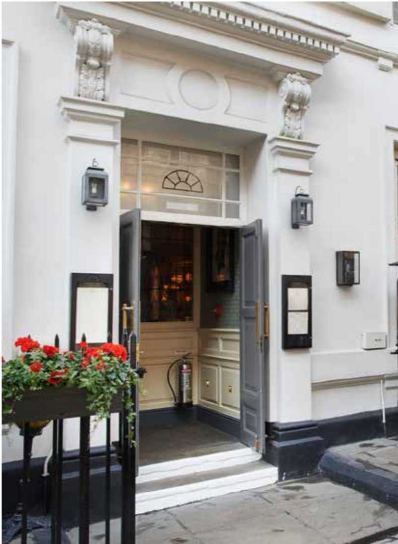
Clockwise from far left: The Snug , exterior of the restaurant