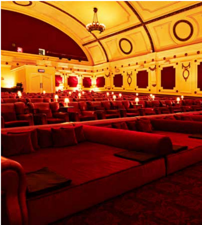
Clockwise from far left: Screening room Electric Shoreditch , Electric Portobello and Electric White City