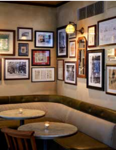
Tables available for large groups