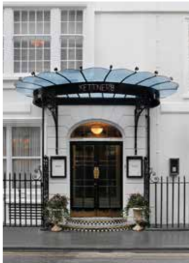
Clockwise from far left: the Champagne Bar, exterior of the Kettners