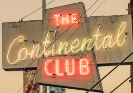
The Continental Club