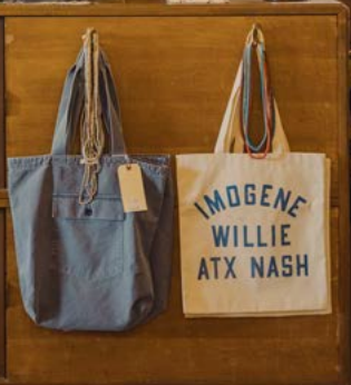
Imogene + Willie