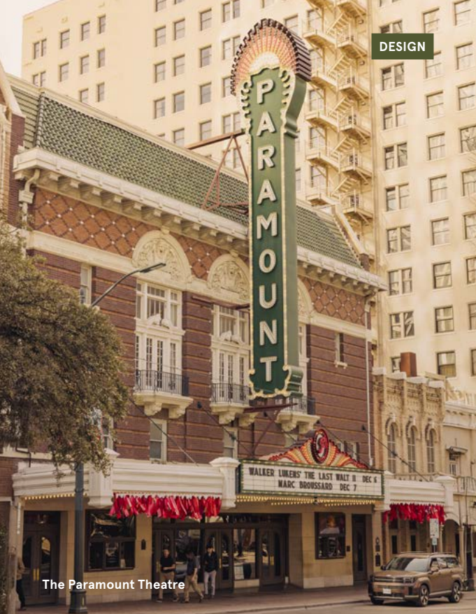
The Paramount Theatre