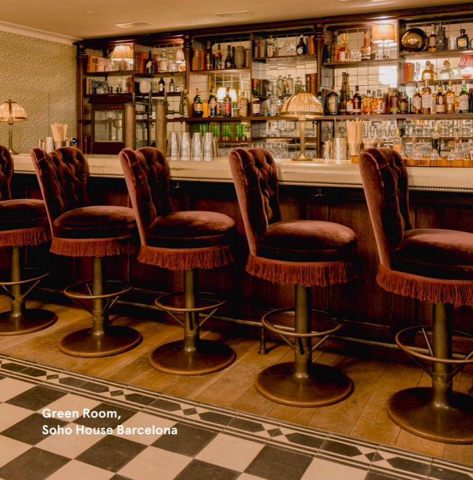
Green Room, Soho House Barcelona