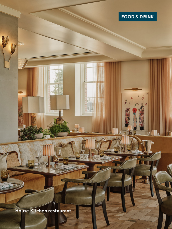
House Kitchen restaurant