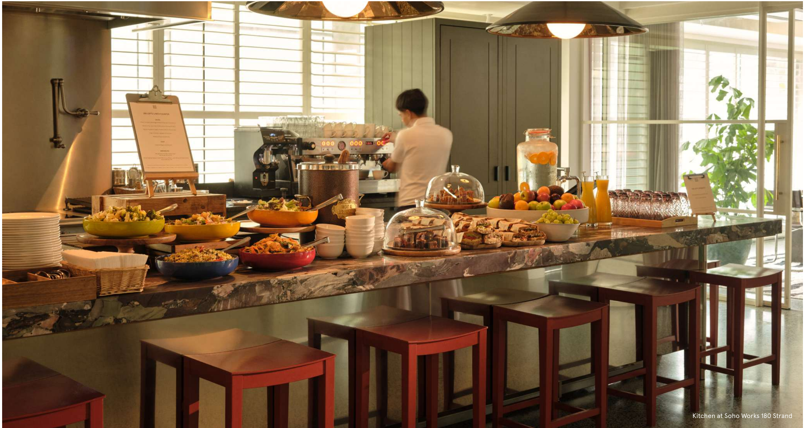
Kitchen at Soho Works 180 Strand