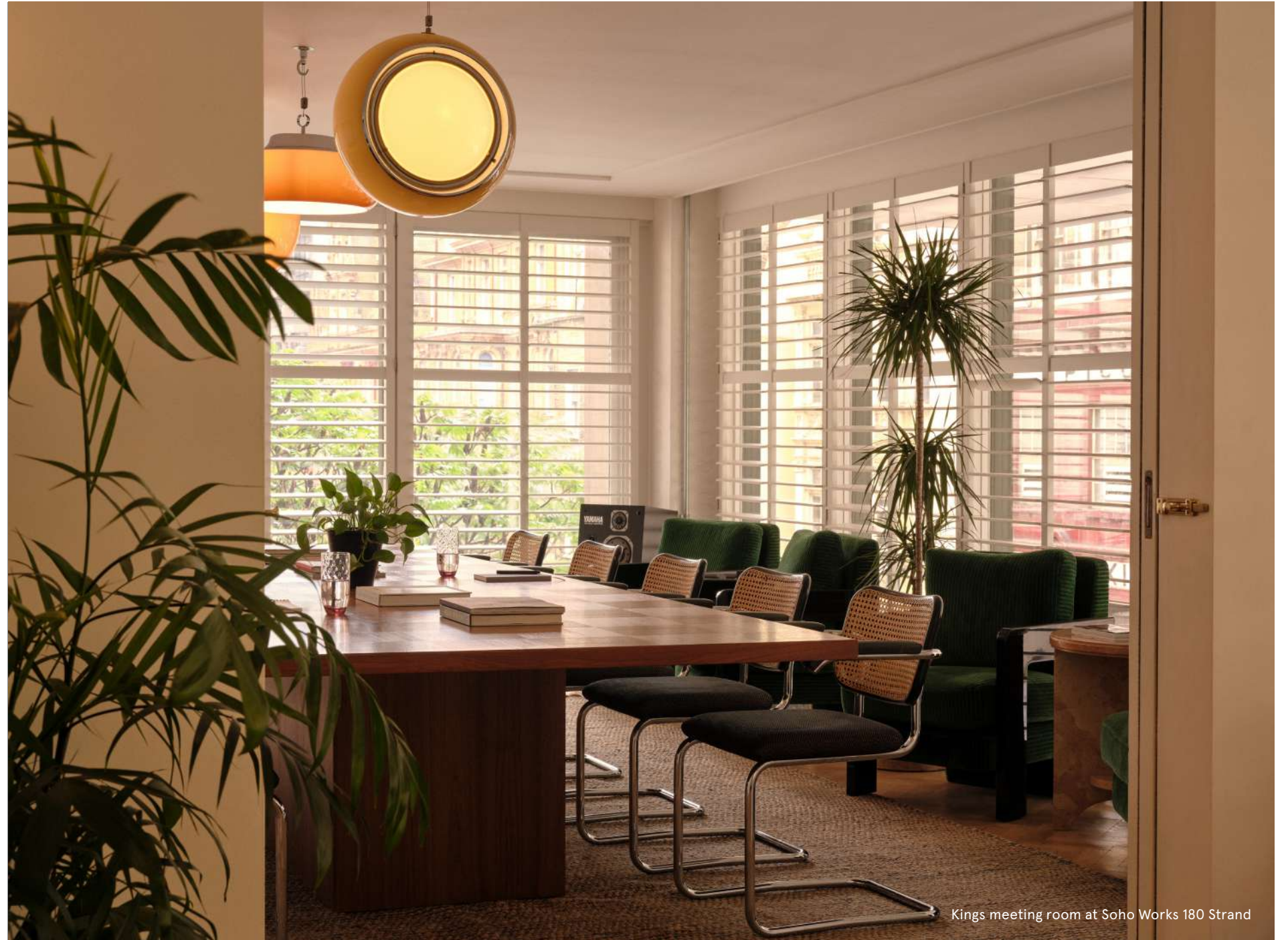
Kings meeting room at Soho Works 180 Strand