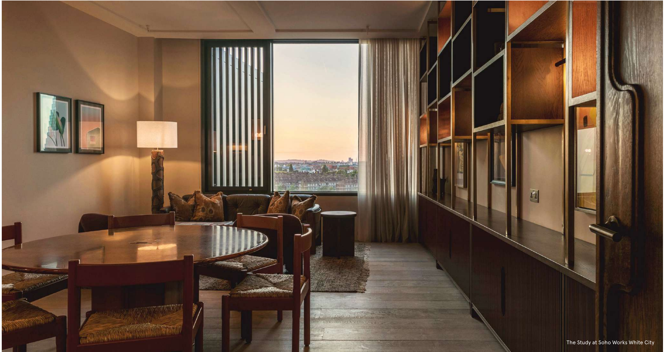
The Study at Soho Works White City