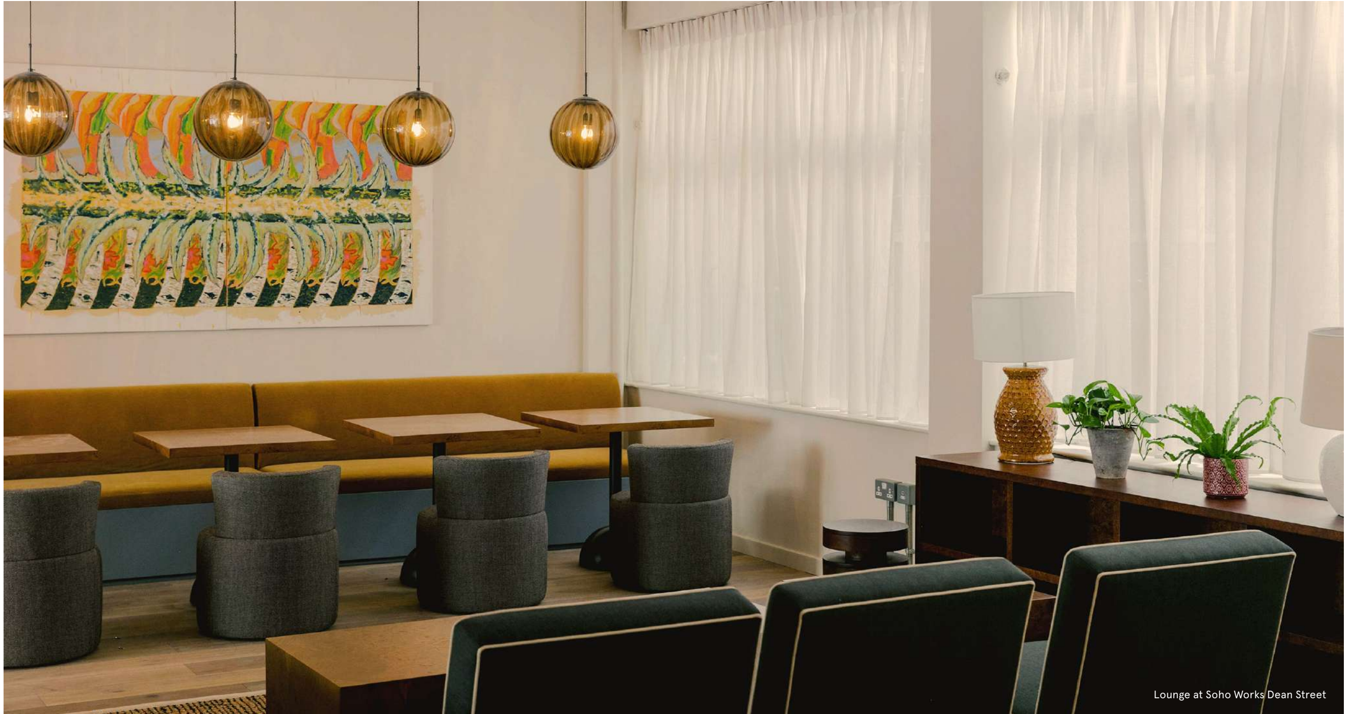
Lounge at Soho Works Dean Street