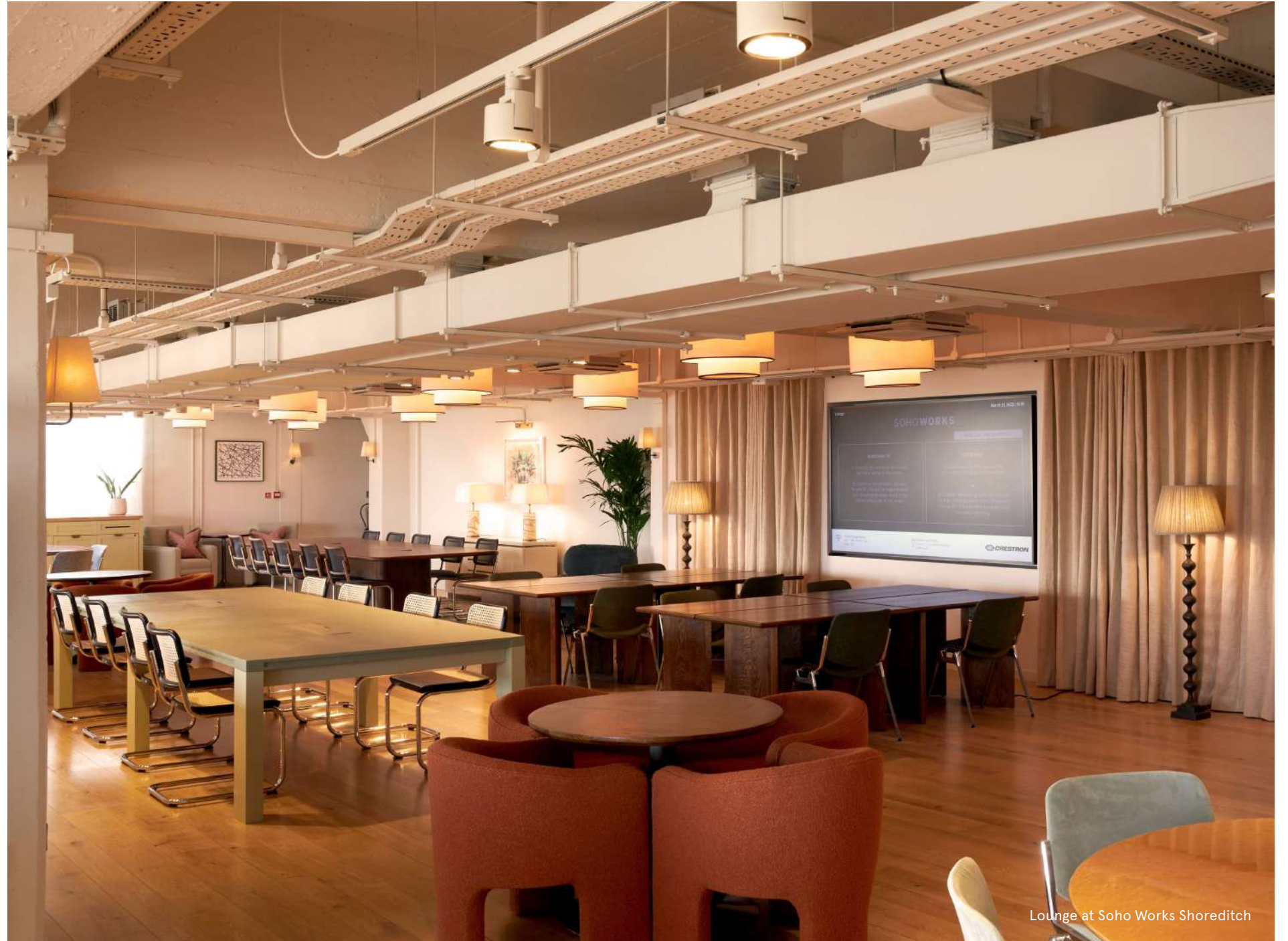
Lounge at Soho Works Shoreditch

T: +44 (0) 20 3841 7600 E: reception@sohoworks.com