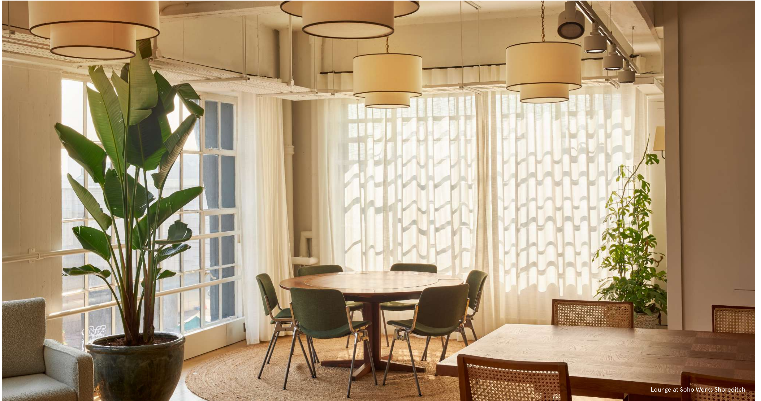
Lounge at Soho Works Shoreditch