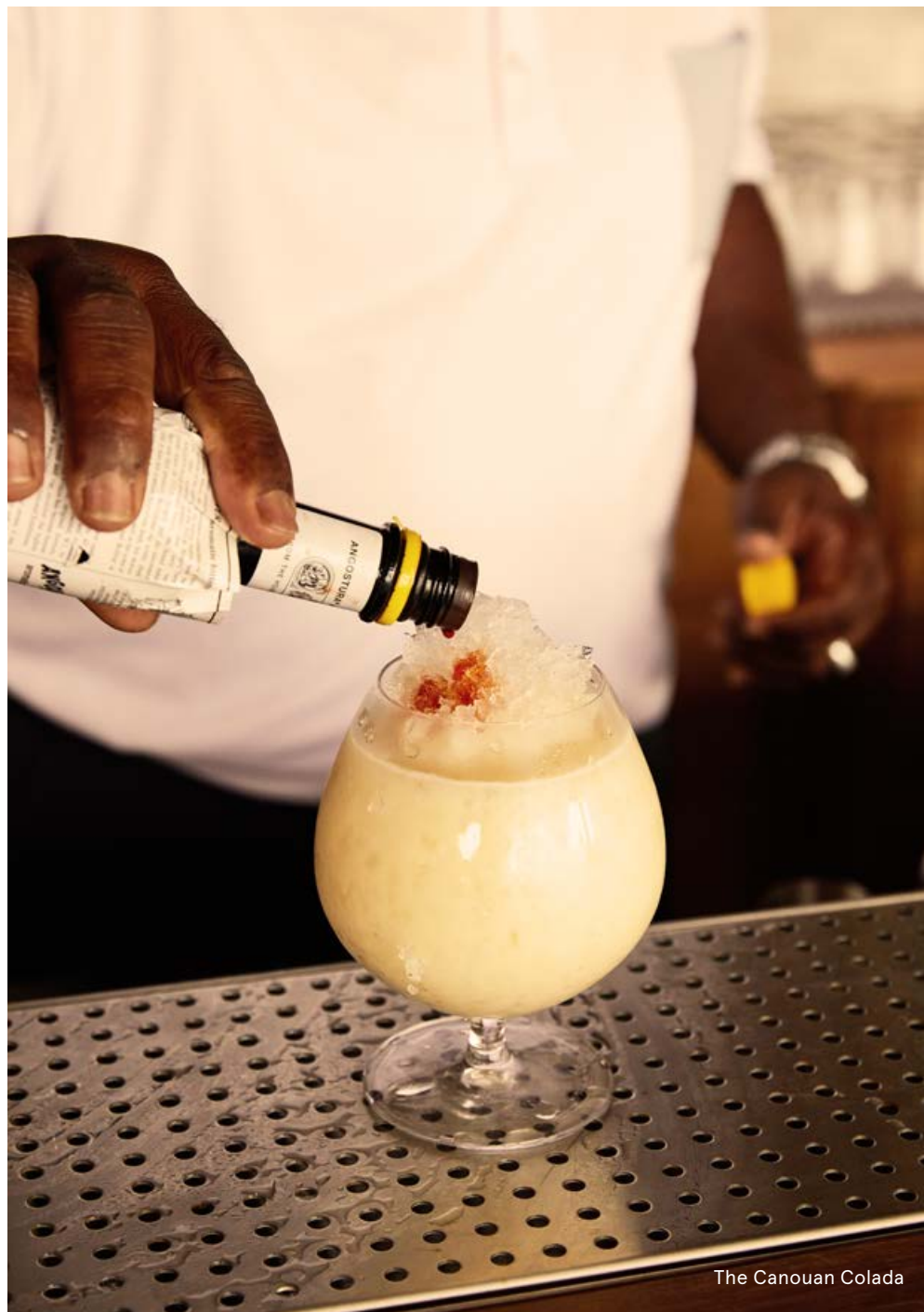
The Canouan Colada

On Sundays, members and guests are invited to join us for our buffet-style brunch – featuring a selection of pastries and tropical fruit, as well as hot dishes.