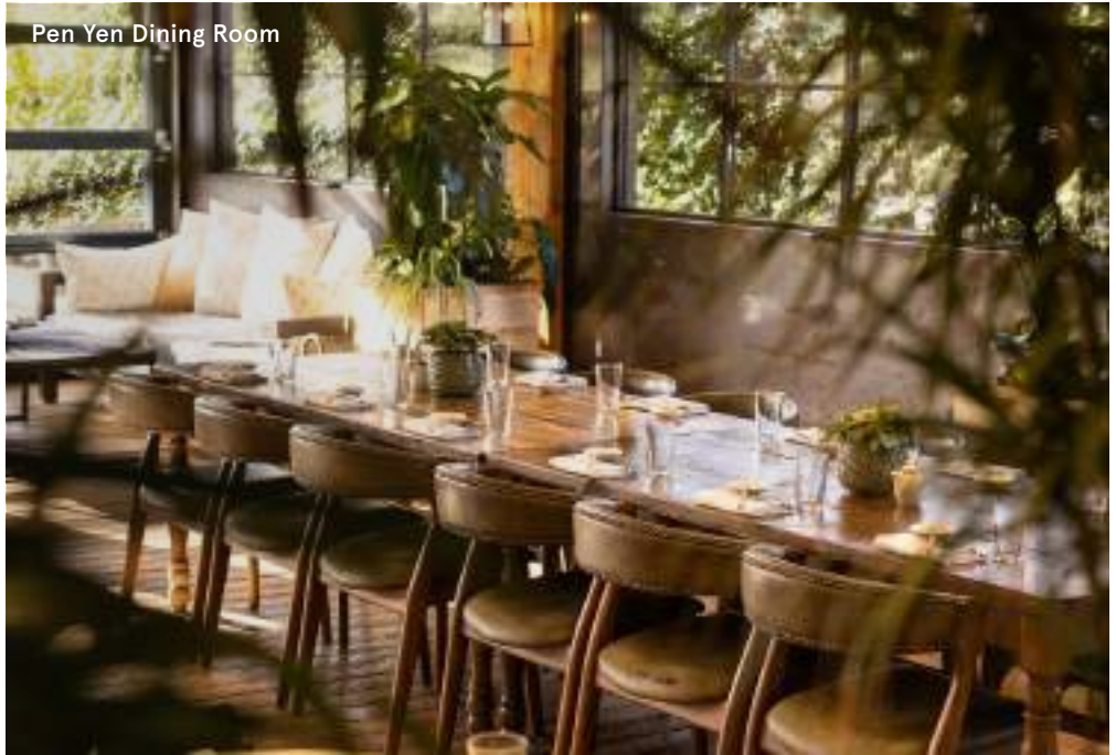
Pen Yen Dining Room