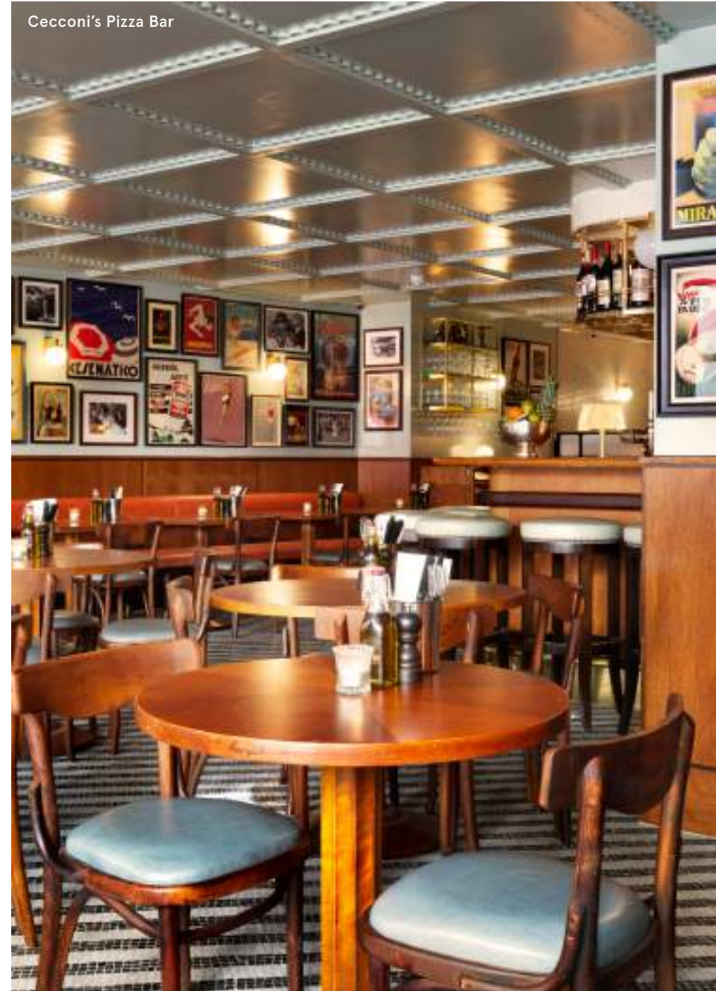
Cecconi's Pizza Bar