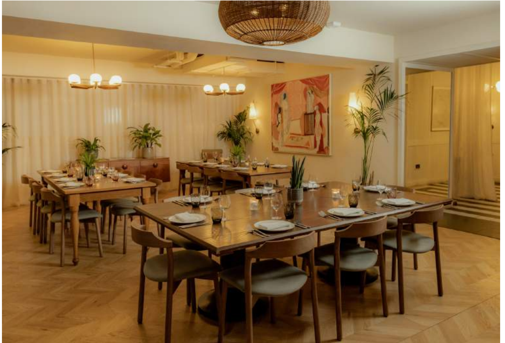
Set in the heart of east London, alongside the cafes and bars of Shoreditch, Cecconi's Shoreditch Private Room is suited to dinners, celebrations, creative workshops, and brand events.