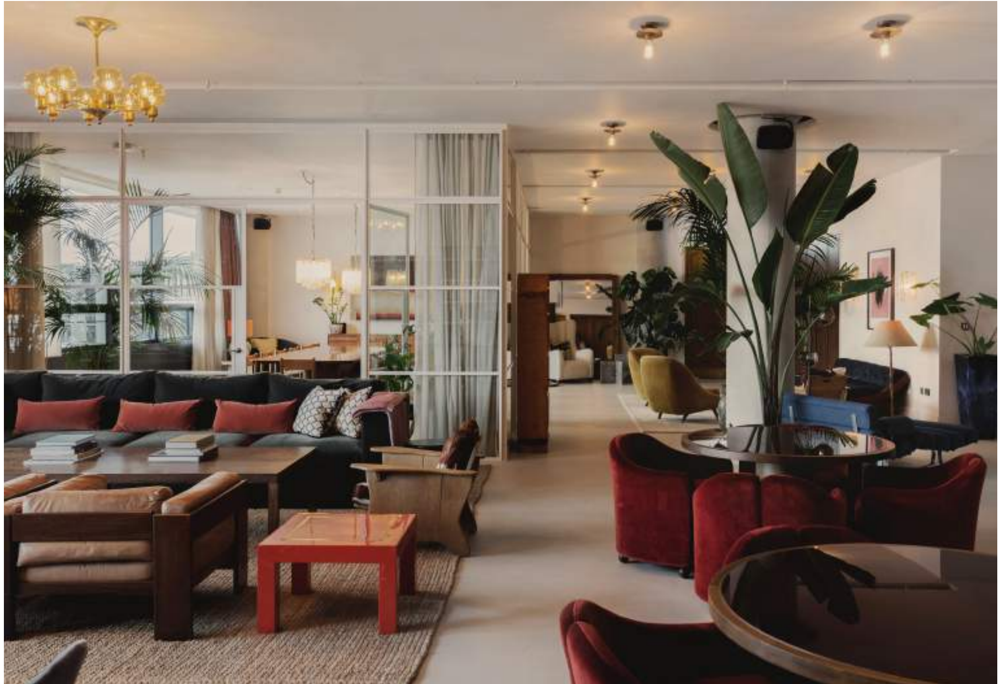
Located in west London, inside the former BBC headquarters, Soho Works White City features five areas that are available for private hire, including cosy library spaces and expansive lofts that are ideal for large meetings or presentations.