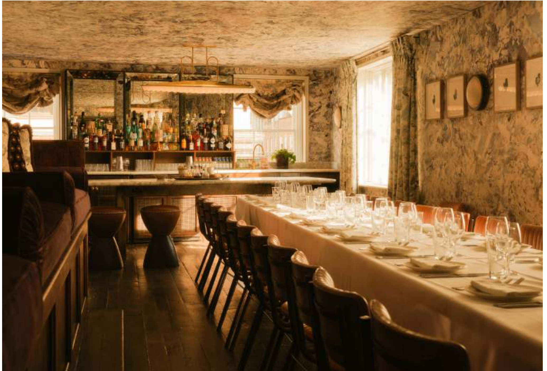
Located in the heart of London's Soho, the original Soho House at 40 Greek Street is home to two event spaces suited to everything from private dinners to cocktail receptions.