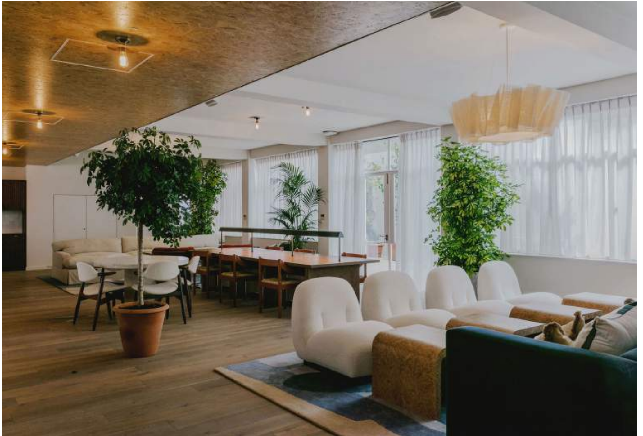
Set in the heart of Soho, opposite 76 Dean Street, Soho Works Dean Street is a workspace spread across four levels with a range of meeting and events rooms available for private hire.