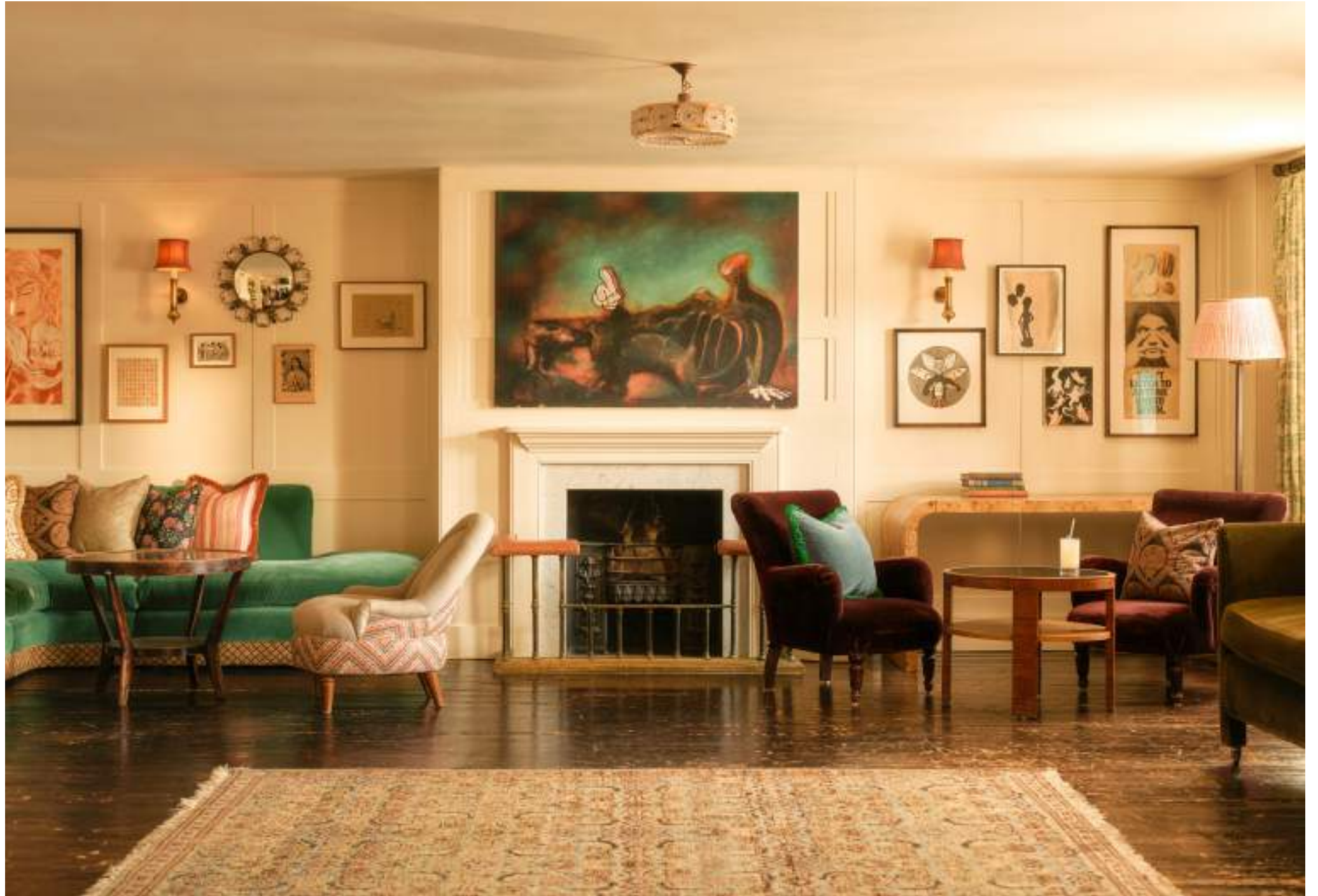
Set inside an 18th-century townhouse, Soho House 76 Dean Street features original, Grade II-listed structures, as well as three private event spaces, including a screening room, Library Bar and Sitting Room.