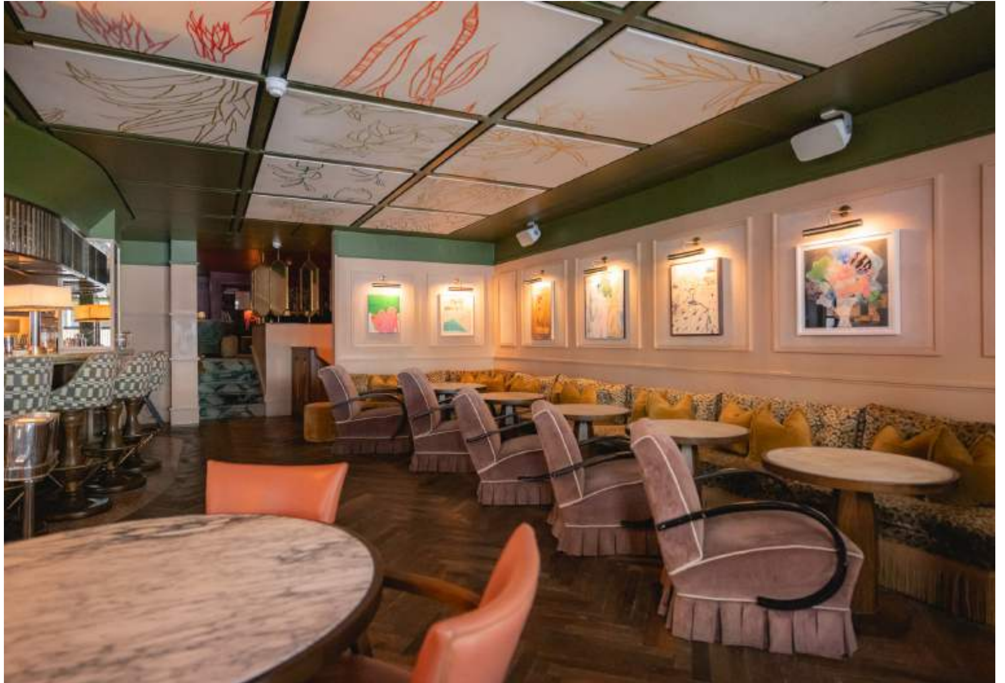
Situated on Balham's Bedford Hill, our first House in south London features a custom horseshoe-shaped bar and is available for full House takeovers, private dinners in the restaurant or cosy gatherings in The Snug.