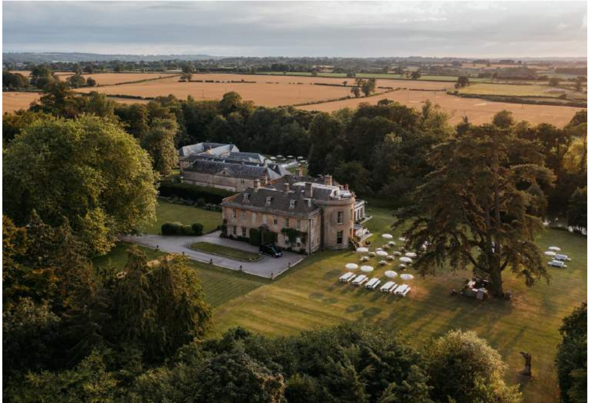
Built in 1705 and set within 18 acres of Somerset countryside, our Grade-II listed rural retreat Babington House is home to multiple indoor and outdoor spaces suited to everything from meetings and supper clubs to drinks receptions, away days, and private screenings.