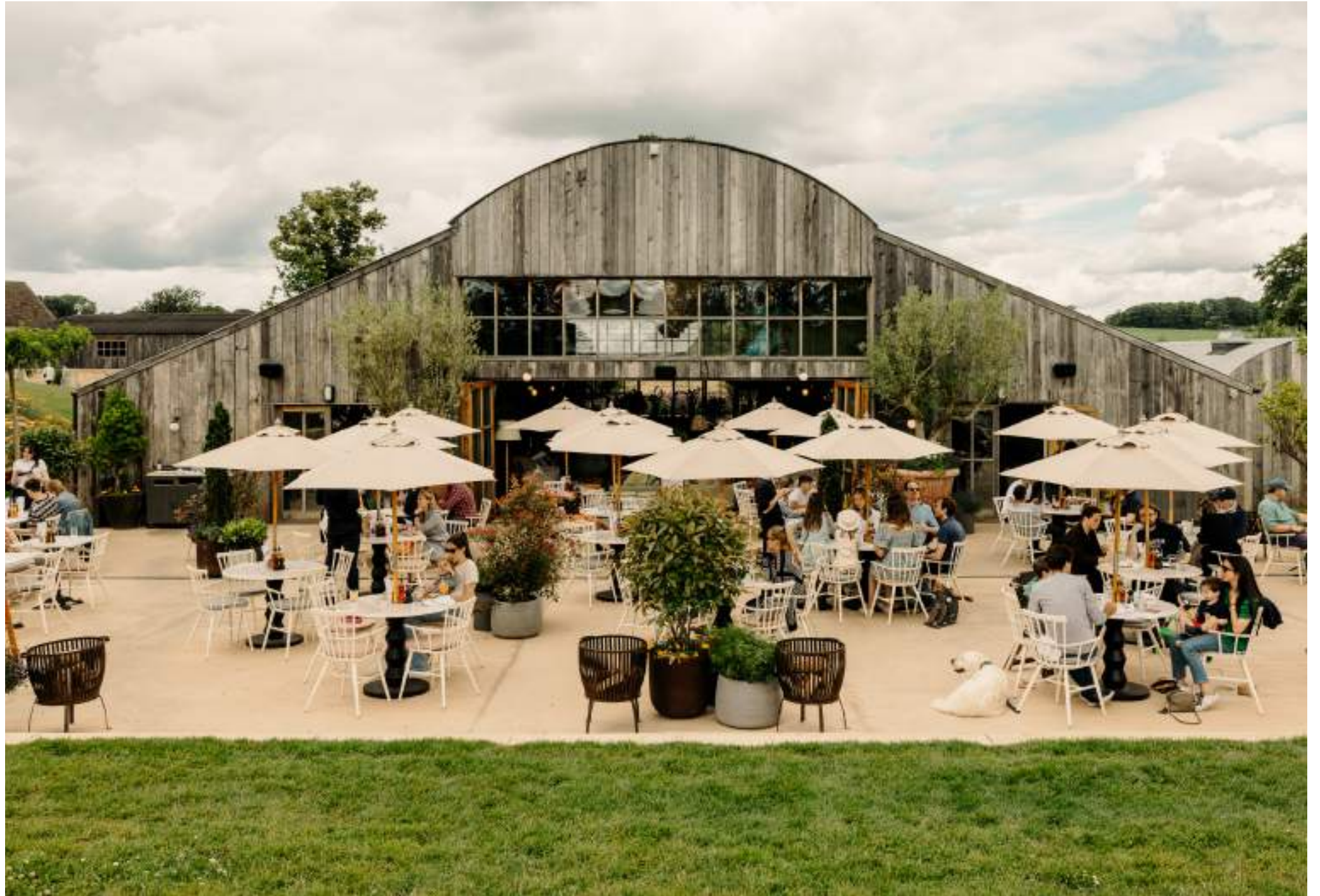
Located in the Oxfordshire countryside, surrounded by 100 acres of idyllic scenery, Soho Farmhouse is home to a number of private event spaces, which are suited to everything from parties and gatherings to dinners and cocktail receptions.