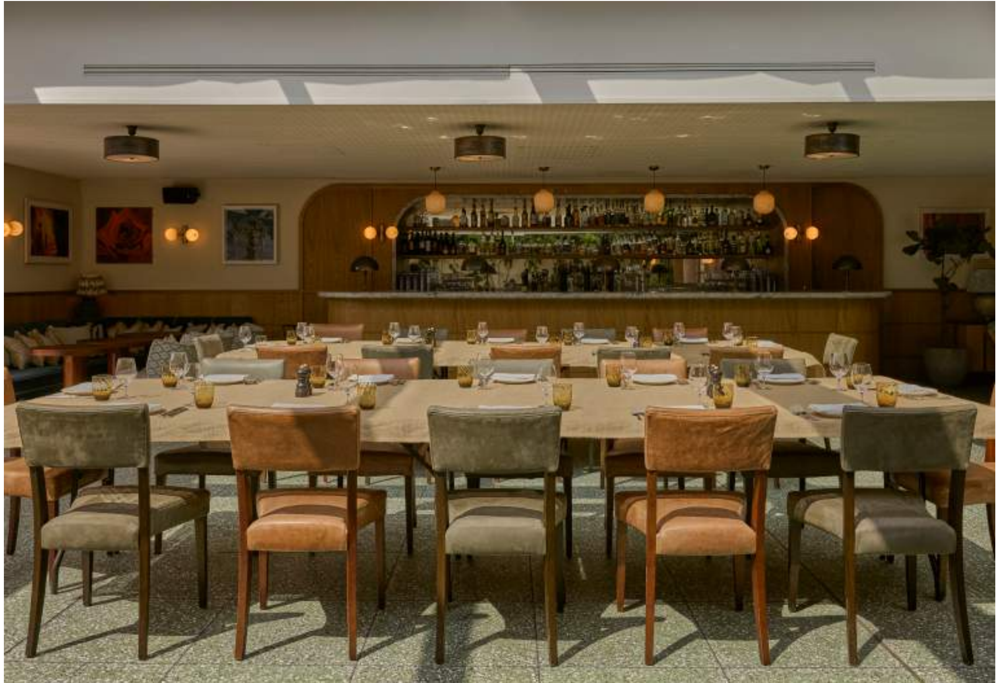
Set within east London's historic Tea Building, Shoreditch House offers rooftop views across the City and two private spaces that can be hired for all types of events, from drinks receptions to meetings.