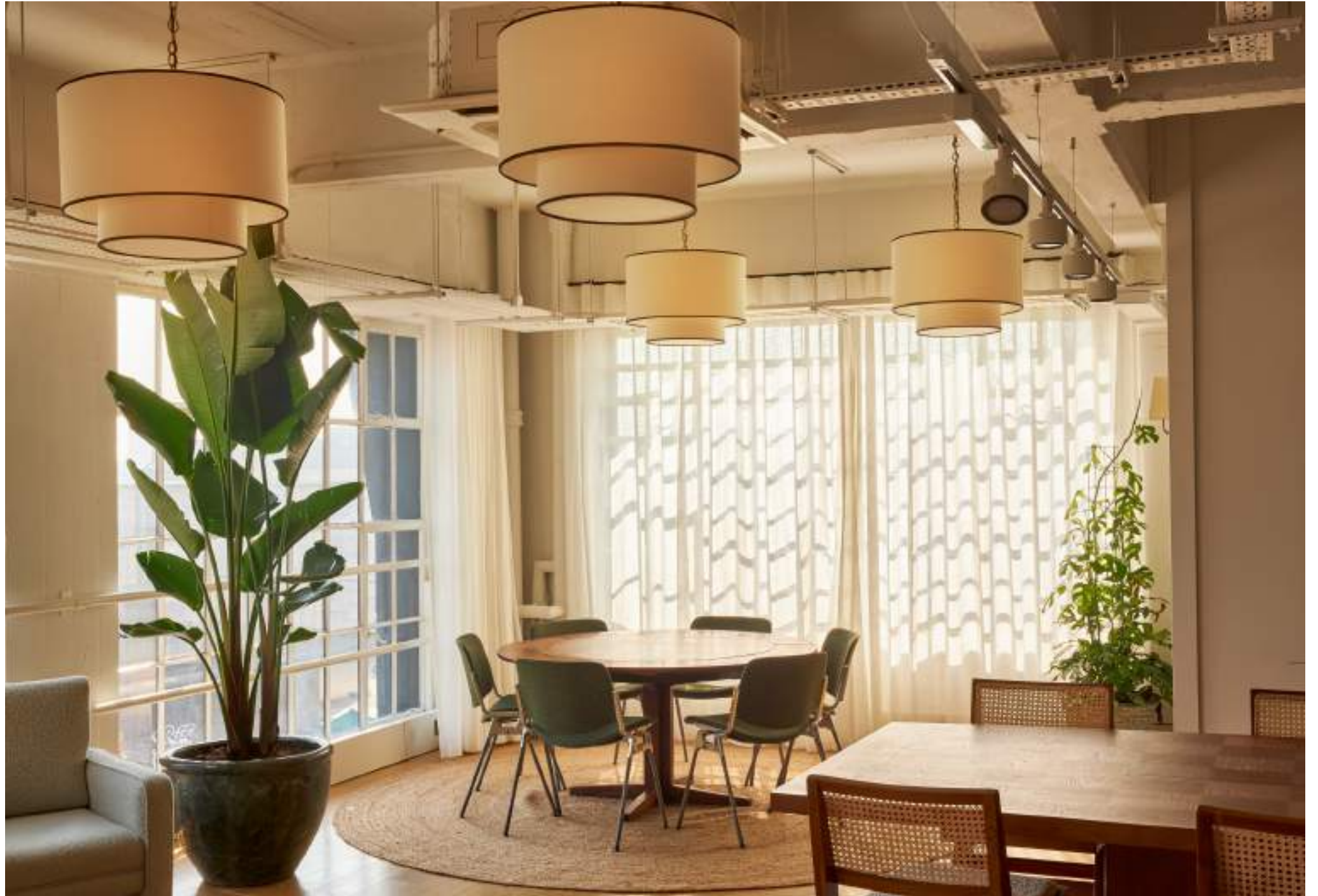
Set inside the same building as Shoreditch House, Soho Works Shoreditch includes three spaces suited to private events, including a spacious lounge with a large screen for presentations, plus a compact meeting room with space for up to five people.