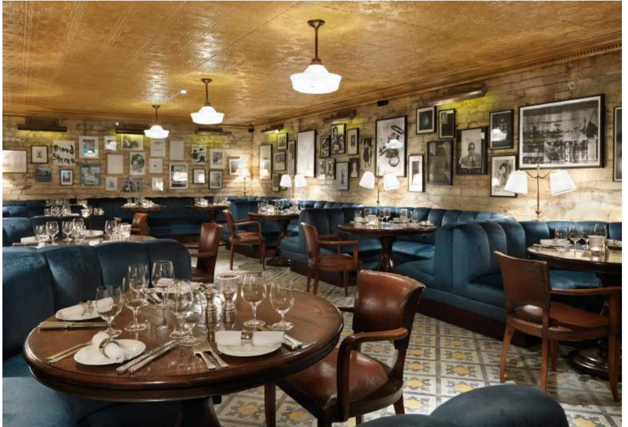
Situated on a quiet corner in central London, Little House Mayfair features a cosy restaurant space, which can be hired for private dining. Plus, if you're planning a large gathering or party, you can take over the whole House on Sunday evenings from 6pm.