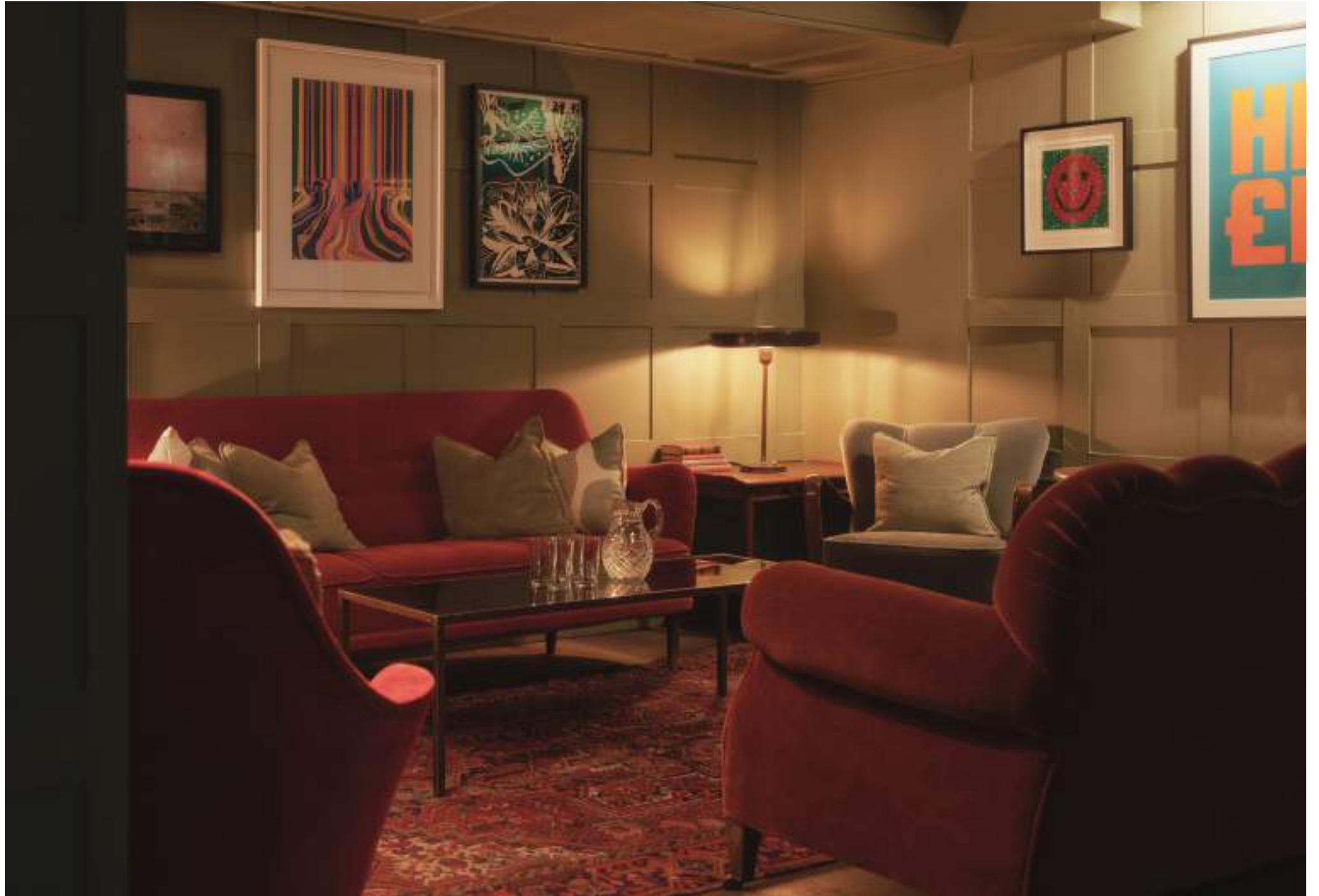
A short walk from the river in west London's Chiswick, High Road House is home to a French-inspired brasserie, a bar and bedrooms. Plus, host an event inside one of the private spaces, designed for a variety of occasions from parties to meetings.