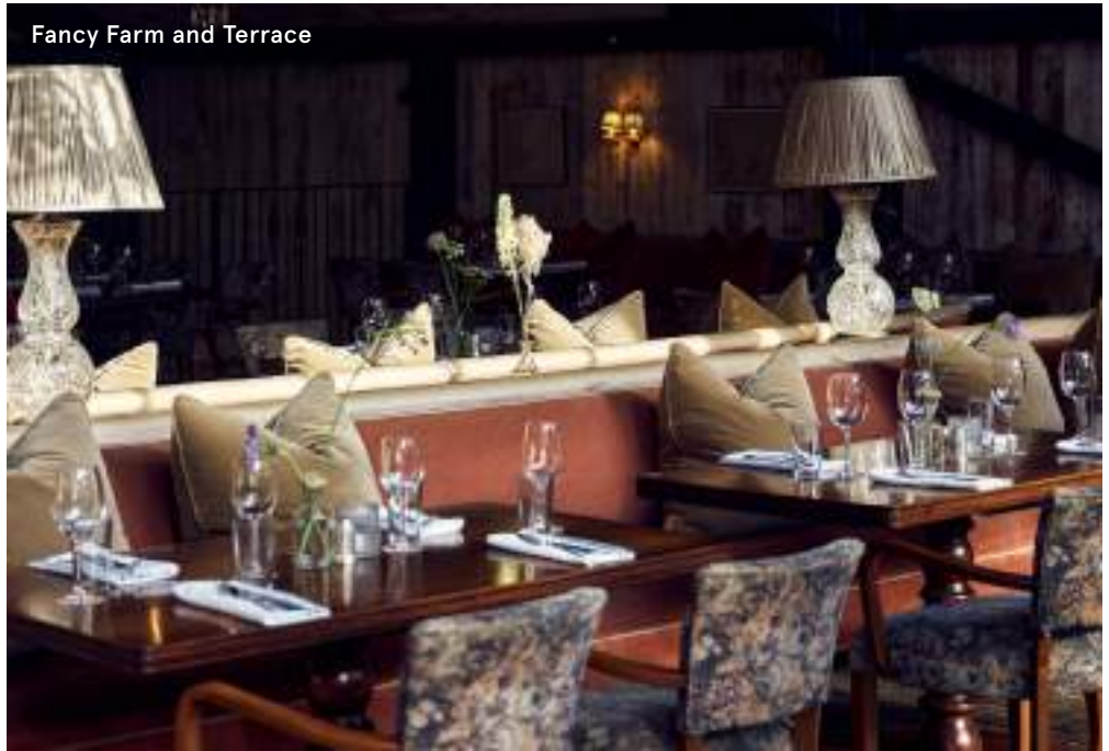
Fancy Farm and Terrace