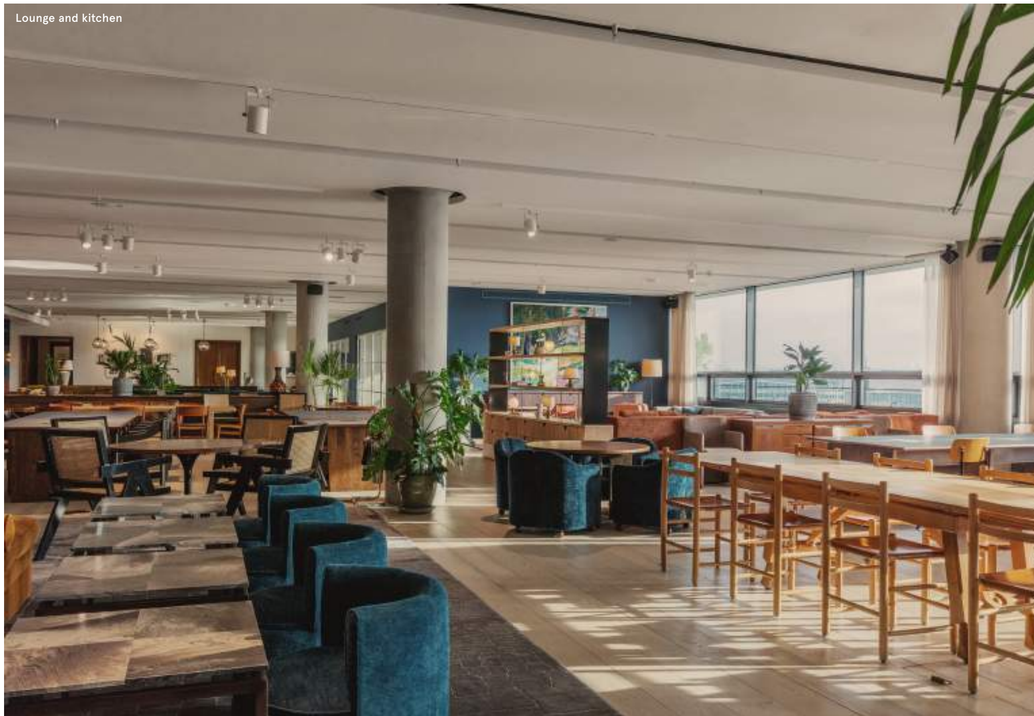
Lounge and kitchen