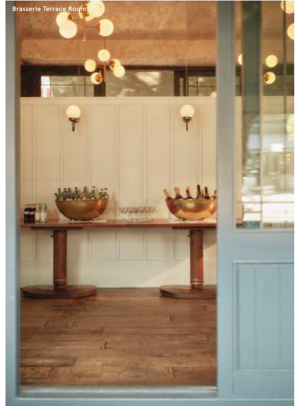
Brasserie Terrace Room