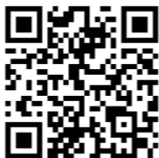
High Road House